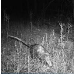
North Mexican Virginia opossum