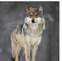
Mexican gray wolf

Keep an eye out for these species and document them in iNaturalist!