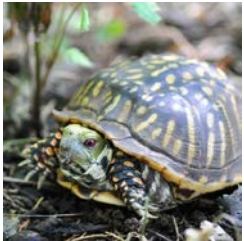
Ornate box turtle